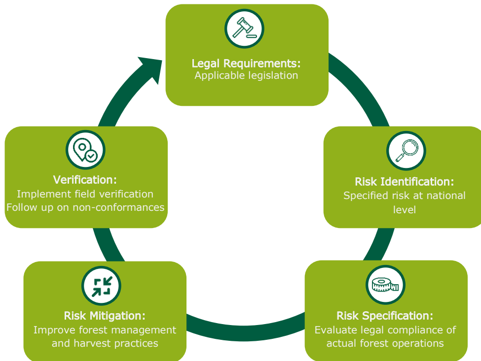
Figure 1: Risk assessment, mitigation and verification process